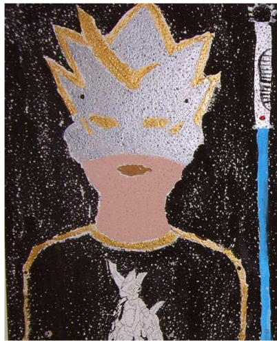
Some self-portraits portrayed alter-egos.